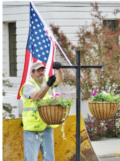
Flower baskets go up in Wallace.

Visitors Center For a majority of tourists,